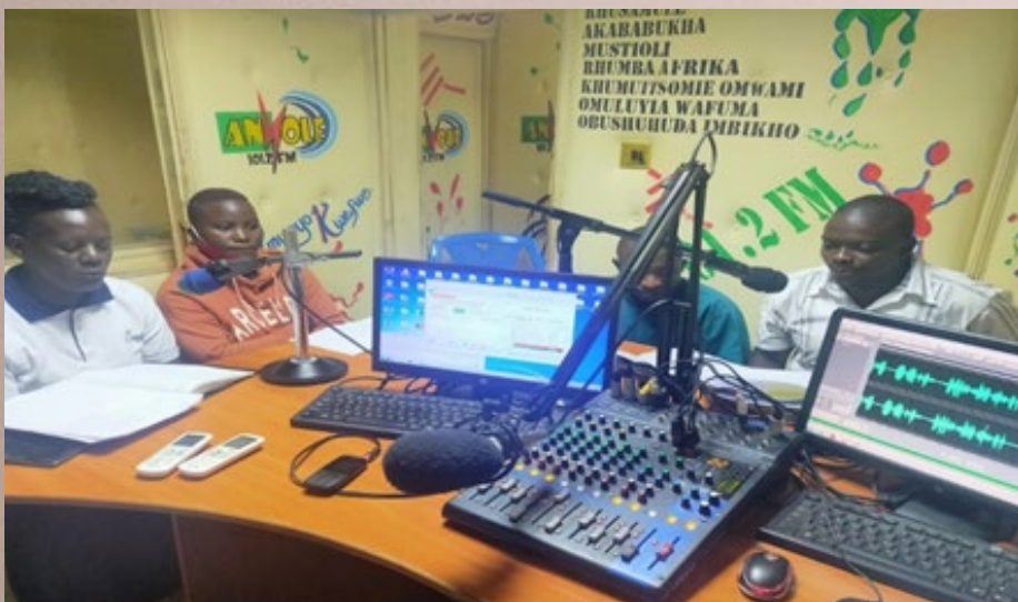
Frontline Church Partner and youth doing a presentation.