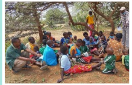
A Public Health Officer training caregivers on the Dangers of FGM in Laikipia

Female Genital Mutilation is so deeply ingrained in traditional culture. Due to this, we are