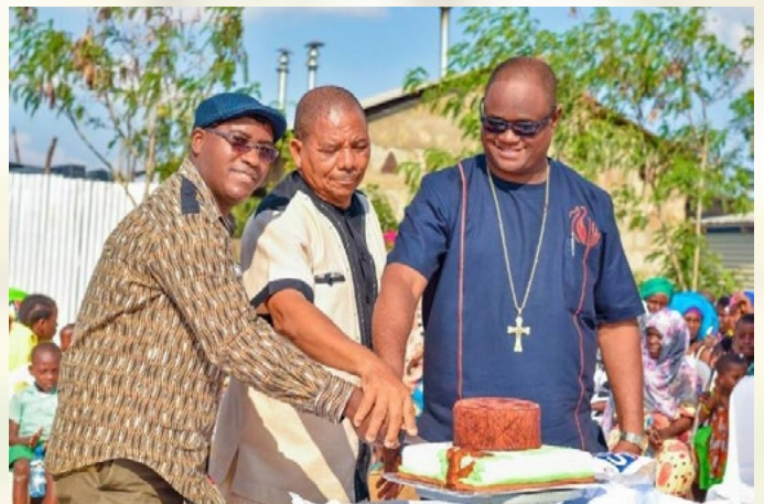
The chief guests cutting a cake to commemorate the launch of the environmental conservation project.

In attendance was our managers of partnerships, the Governor's office, spiritual leaders from the region, regional government administrators, local school headteachers, caregivers, program participants, and over 300 community members.