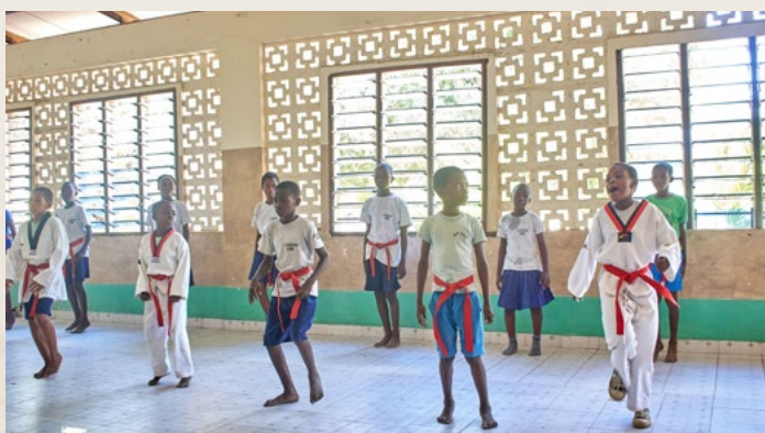
Children performing a play at the exhibition event.