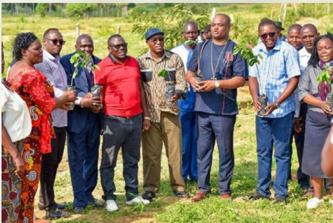
Invited guests ready to plant trees at Maweu PEFA Church.

Prolonged drought has been a challenge for the community in Kwale cluster. The unpredictable weather patterns have affected food security and precipitated the loss of livestock. The 15 churches in the Kwale cluster came together to spearhead the planting of 500,000 drought-resistant trees and fruit trees within the church compounds, homesteads, and public facilities across the sub-county by 2023.