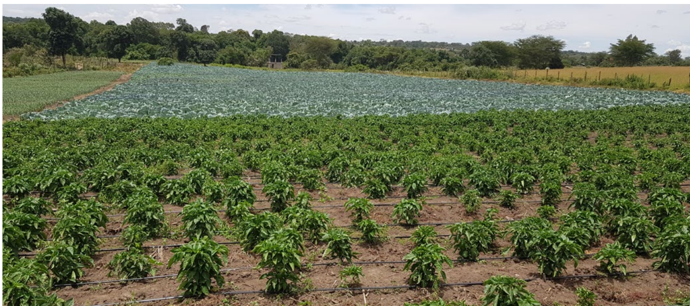
A bird's eye view of the Olepolos horticulture farm.

As a result of this project, caregivers have grown different vegetables like kale, spinach, cabbage, tomatoes, capsicums, onions, amaranths, spider weed, and black nightshade.