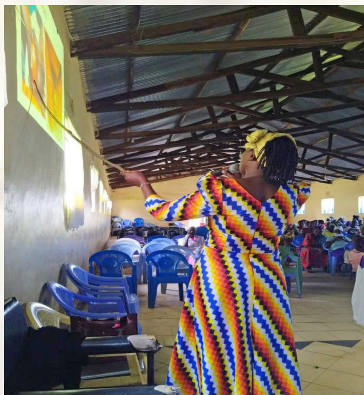
Training session with parents on the dangers of FGM