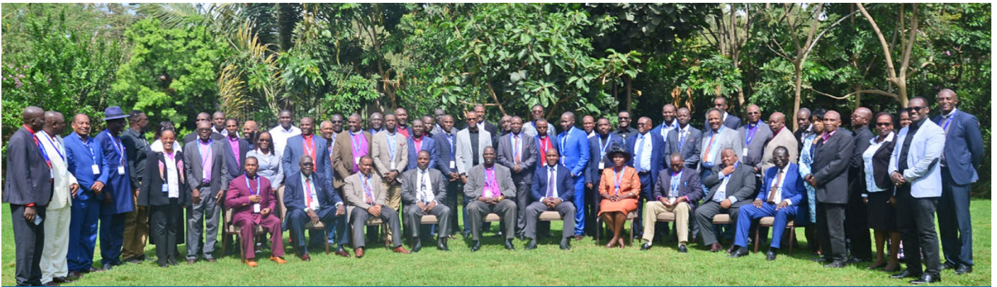
Frontline church partners with the guest speakers and the Compassion team.