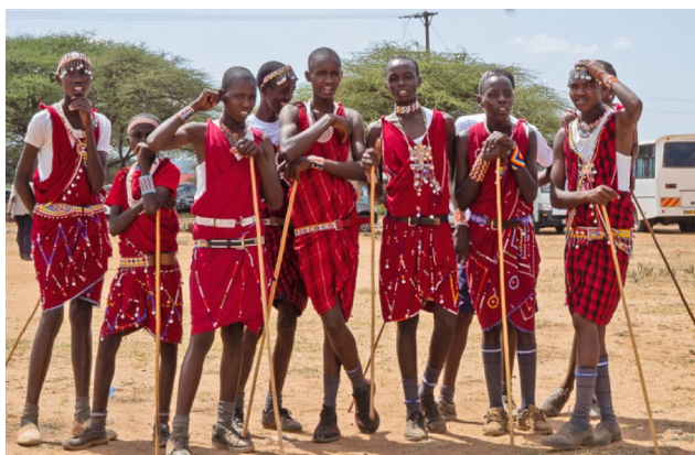
Boys wearing traditional Maasai regalia during the Day of the African Child at Elangata Wuas School in Kajiado. June 16, 2022.