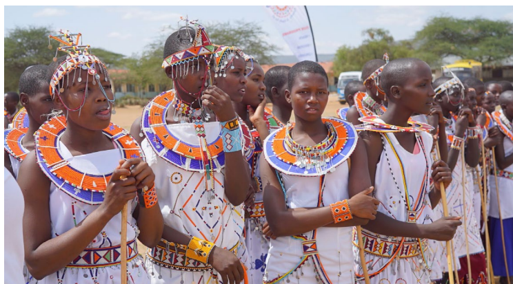
Girls wearing traditional Maasai regalia during the Day of the African Child at Elangata Wuas School in Kajiado. June 16, 2022.