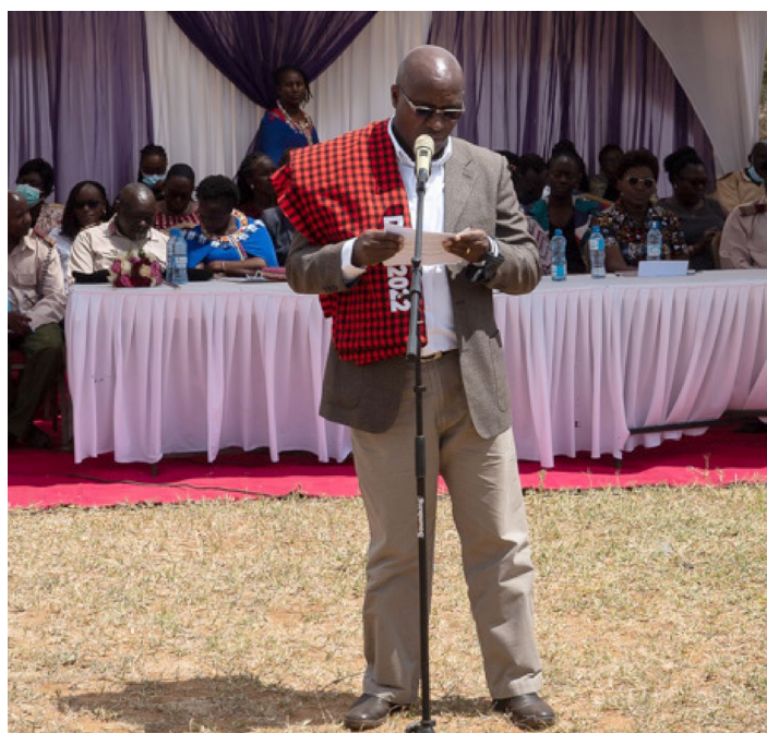
Compassion International National Director giving his remarks during the Day of the African Child Celebrations in Kajiado County.

As the advocacy messages against harmful practices continue to sink in, it is evident that the shared commitment from all stakeholders will create an enabling environment for children to develop and thrive.