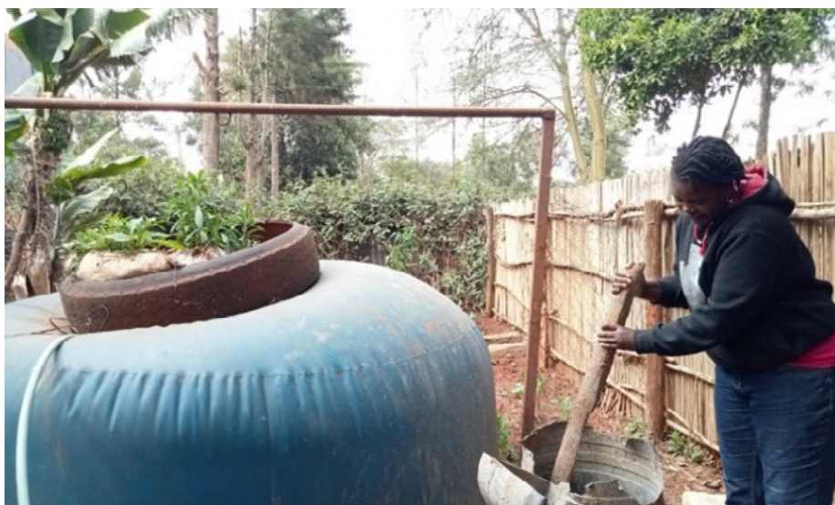
Carol utilizing the pig waste to feed the bio-digester

Her primary market is a local company, Farmer's choice, to whom she sells mature pigs. She also sells piglets to local farmers. Utilizing the organic waste from the pigs, she has built another revenue stream by selling clean, renewable cooking gas and rich fertilizer to local farmers. It aligns with the funding objective of championing sustainability and environmental protection.