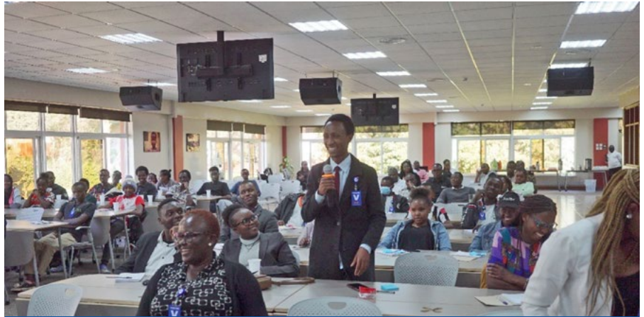
Youth asking the panel a question

On August 15, every year, we celebrate International Youth Day. However, due to the election period in Kenya, the celebrations were postponed to September 21, 2022. The event took place at our offices in Karen.