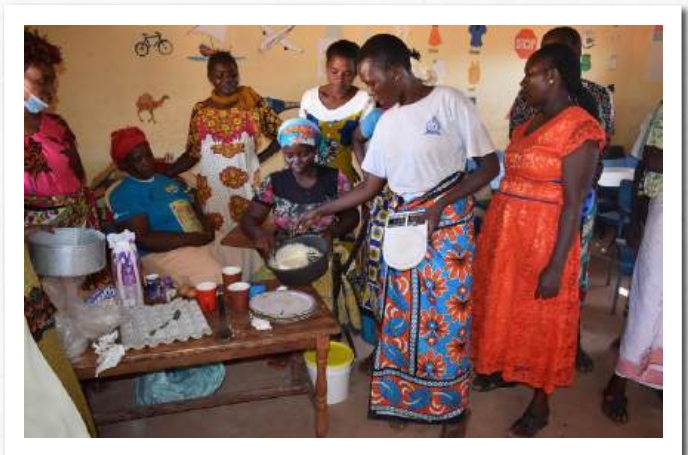
By, Ebenezer East African Pentecostal Church.

It is through these skills that our caregivers can now shine. Families are empowered, and we still strive to nurture other skills. The number of malnutrition cases and poor parenting issues have been reduced in extraordinary measures. The impact realized by empowering our caregivers is so significant that it has given us more energy to work on total caregiver empowerment.