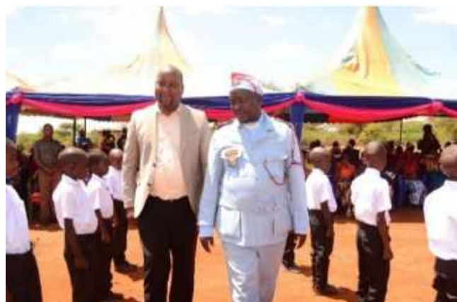
Hon. Johnes Mwaruma, Taita Taveta Senator

The discovery prompted the church to request a survival intervention program. When AIC Makutano partnered with Compassion in 2016, it did not have the proper infrastructure to facilitate all the staff and participants' activities. Through this partnership, the church constructed a modern and decent toilet.