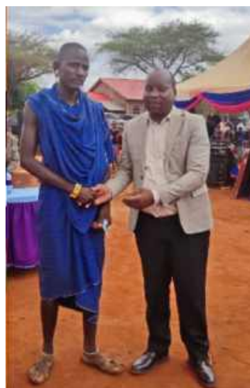
The Fathers are not left behind!

The survival intervention program participants were trained on the importance of Ante Natal clinics and safe deliveries. Fathers were also encouraged to be present and involved to ensure family stability.