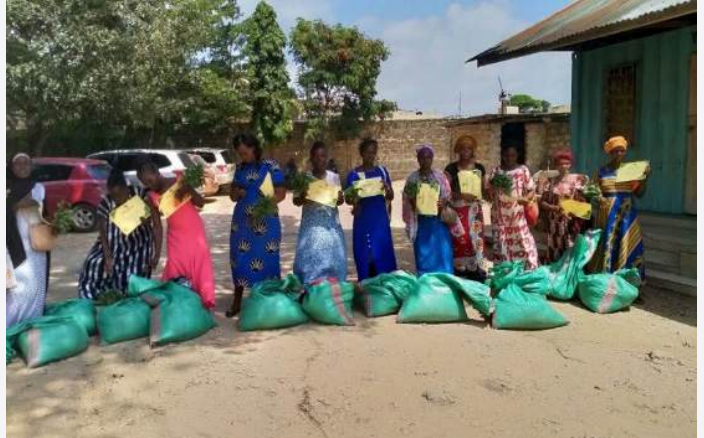
A group of caregivers after getting their certification from the Association of Women in Agriculture-Kenya (AWAK)

In Partnership with the Association of Women in Agriculture-Kenya (AWAK), whose objective was to empower vulnerable mothers living in Kisauni informal settlements economically, we have collaborated to support 101 mothers of our program participants.