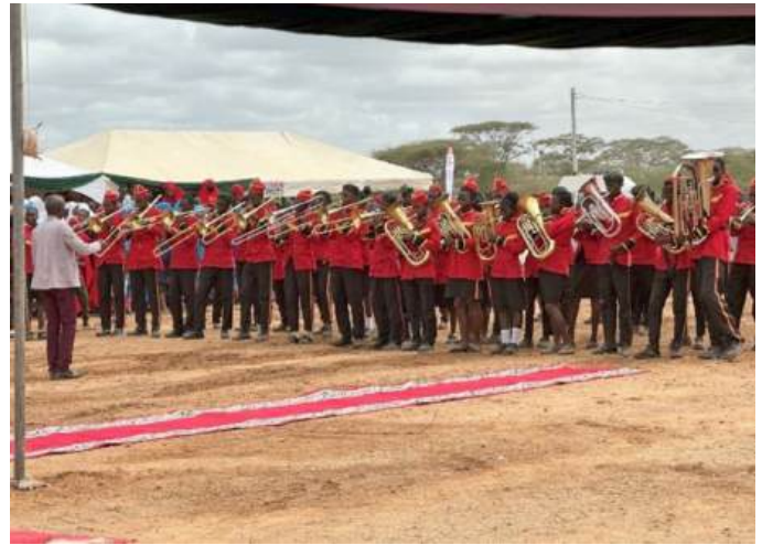
Compassion Participants Procession Band at the DAC celebrations in Garissa County

Watch the full interview here: https://www.youtube.com/watch?v=rrvjBIPXjQg