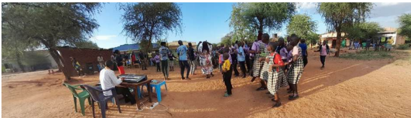
A moment of Parise and Worship by the Program Participants.

The past few months have been fruitful for our Frontline Church Partner in Kanzinwa. They had a successful four-day crusade early this year. The event, organized by the Compassion participants with support from the Church, Child Development Workers, Iserve Africa apprentices, and teachers, was a successful event to share the word of God.