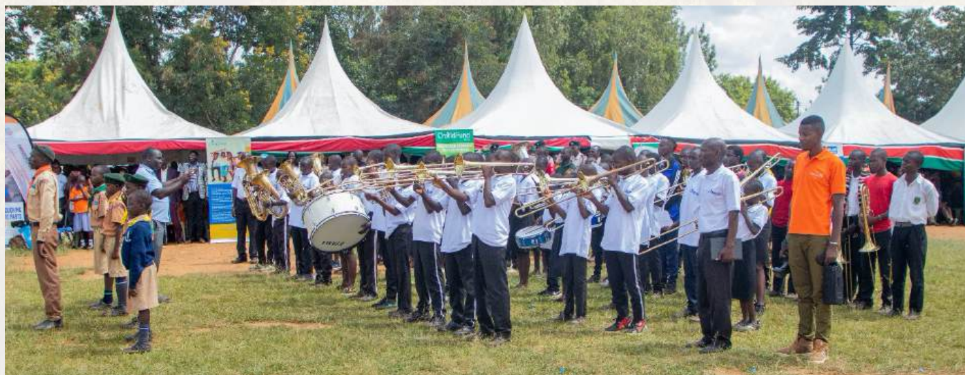
Compassion Participants Procession Band at the DAC celebrations in Busia County.