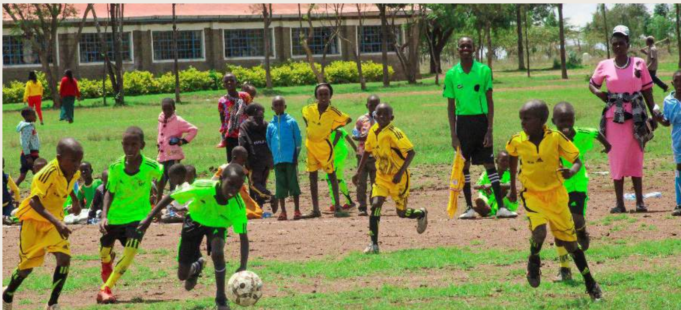
Compassion Participants playing football.

Laikipia recently hosted various sports events, including ball games, and athletics. All 14 Frontline Church Partners in the Laikipia region participated in the scheduled competitions held from May 2nd to May 4th, 2023. The event took place at Mary Mother Grace Boys High School. The games were categorized into pools A, B, and C for seniors, juniors, and beginners.