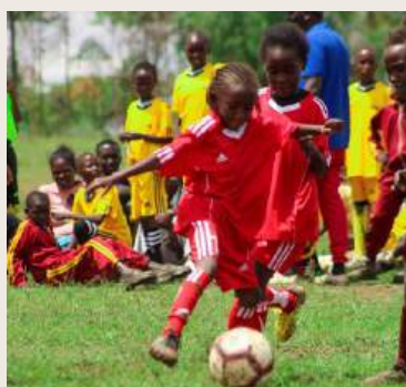
Compassion Participants in a race and playing football at the sports day.

The sports included football, 100m races, 200m races, and relay races.