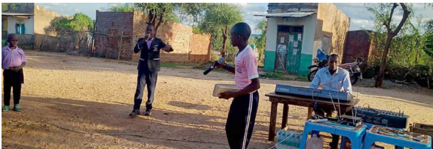
Program participant leading a session at the crusade.