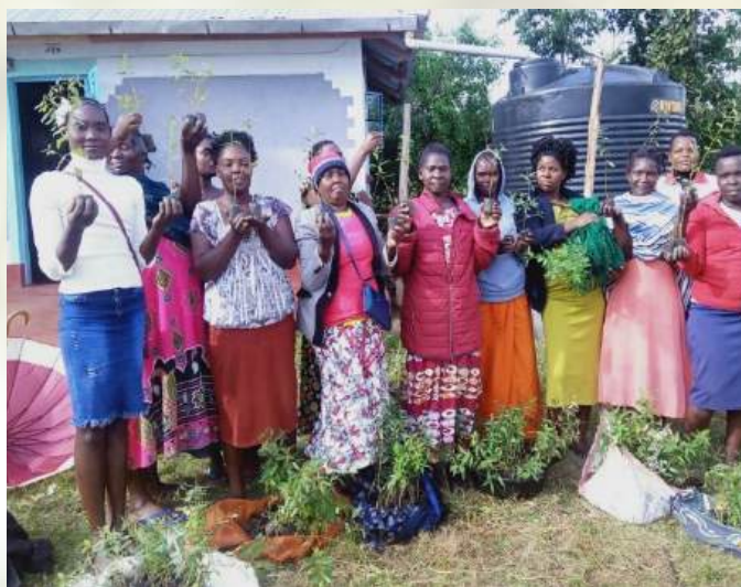
Caregivers with tree seedlings.

One of the objectives the holistic child development program seeks to achieve is to equip the program participants with how to safeguard a healthy and stable environment where every individual has an opportunity to thrive.