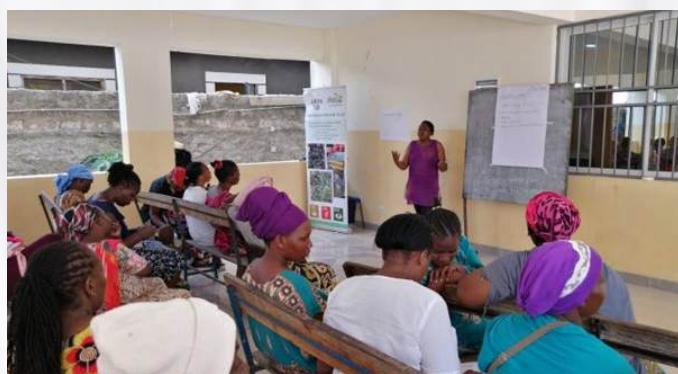
A class of business management.

The program trained 101 mothers whose children were registered participants with skills to manage a vertical story kitchen garden and establish an indigenous vegetable nursery within their limited spaces—helping them to embrace urban farming.