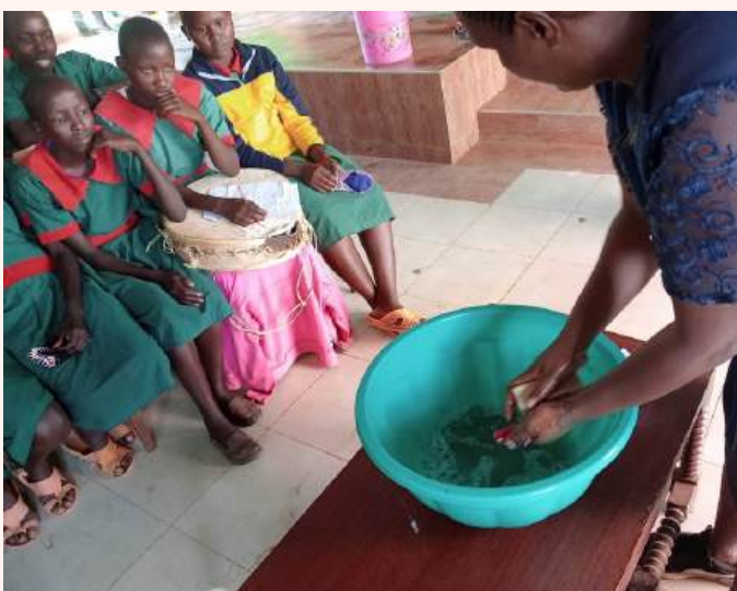
A Public Health Officer demonstrates how to wash the sanitary pads with soap and clean water to teenage girls.