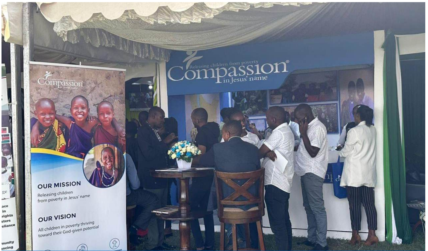
Guest visiting the compassion Booth during the NGO WEEK.

The National Director participated in a round table discussion and Webinar organized by the NGO board. The conversation centred on Compassions' role in achieving Sustainable Development Goals. The National Director emphasized the importance of collaboration and maintaining partnerships with the NGOs Board Kenya and other crucial stakeholders.