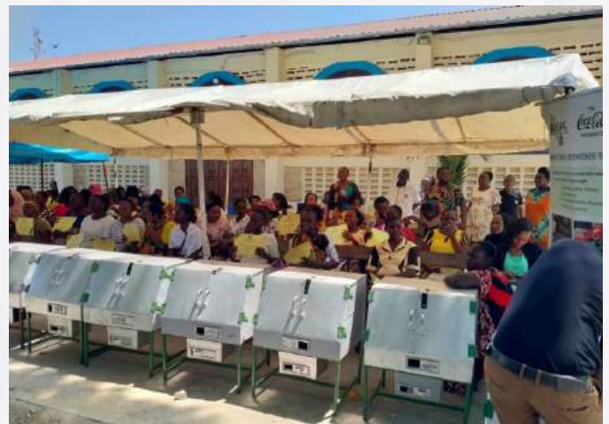
Groups of 12 caregivers who were gifted ovens to start off fortified baking.

We have worked to build their capacity through training in urban farming, food processing, charcoal briquette making (as a form of clean energy), business development skills, and mental health support. We worked to provide food processing and multi-story garden start-up kits to improve their food security, enhance their participation in climate action, increase their income, and reduce poverty.