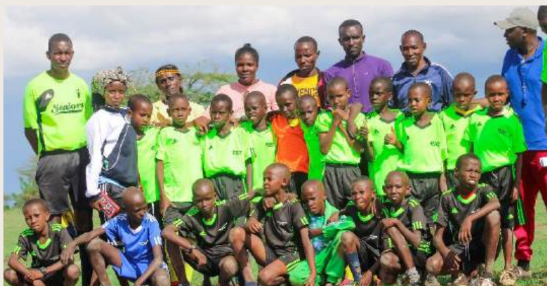
One of the Compassion Participants teams posing for a team photo.