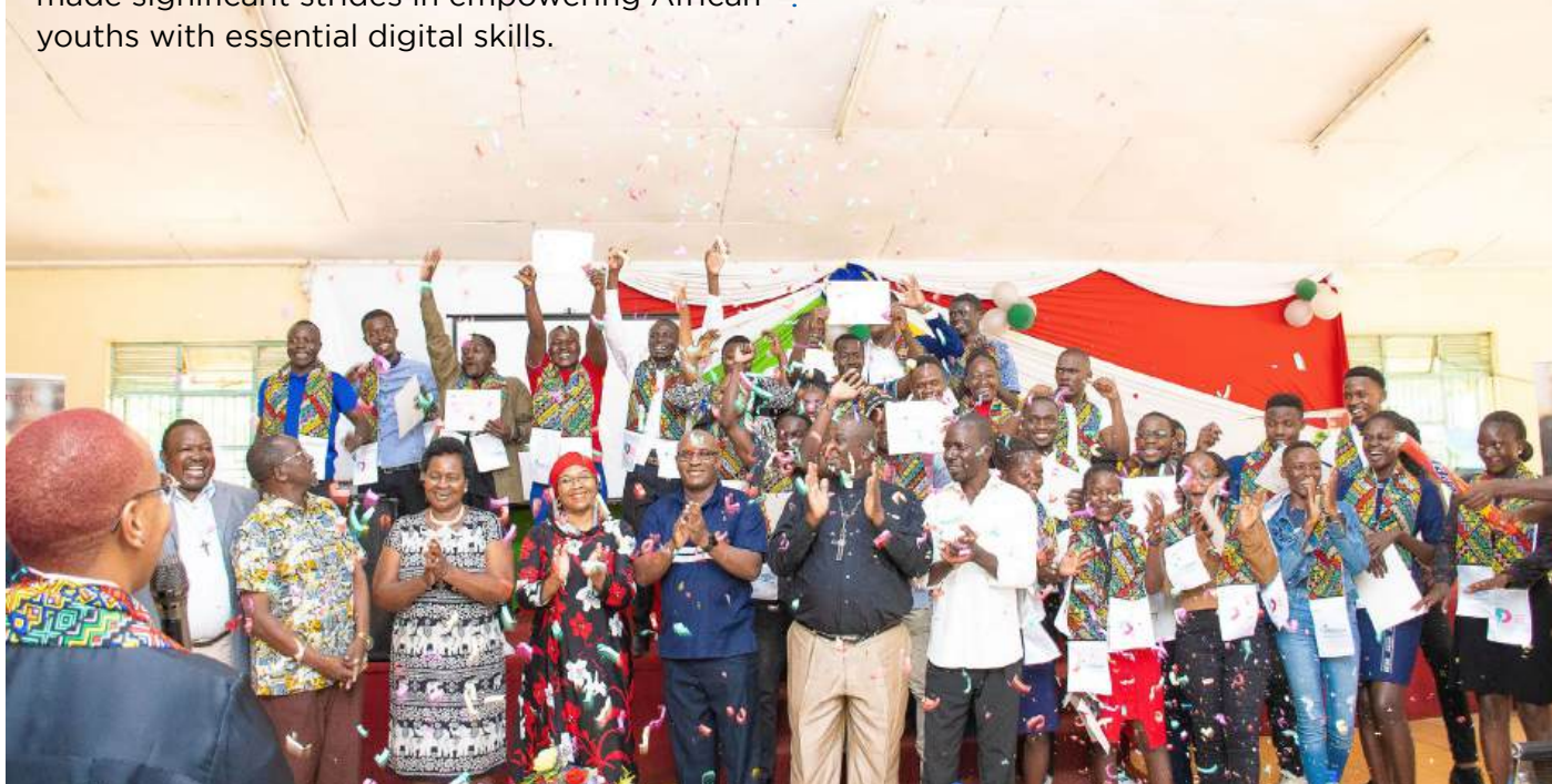
Graduates of Power Learn Project celebration.