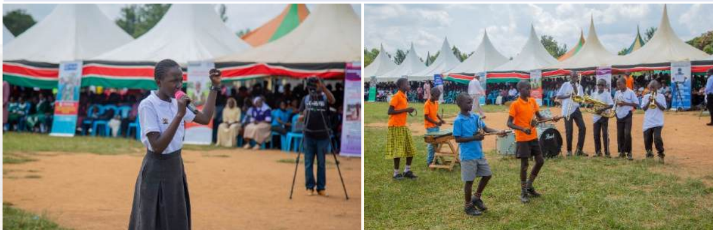
Compassion Participants performing at the DAC celebrations in Busia County.

Compassion International Kenya celebrated the Day of the African Child by advocating for children's rights in the digital world. This annual event focuses on raising awareness about the challenges faced by African children, and this year's theme was children's rights in the digital environment.