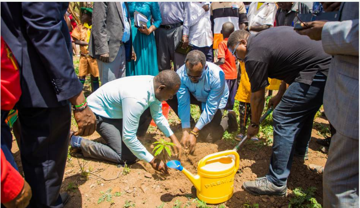
Compassion Kenya team tree planting at a church groundbreaking in Silale, Baringo County Kenya.