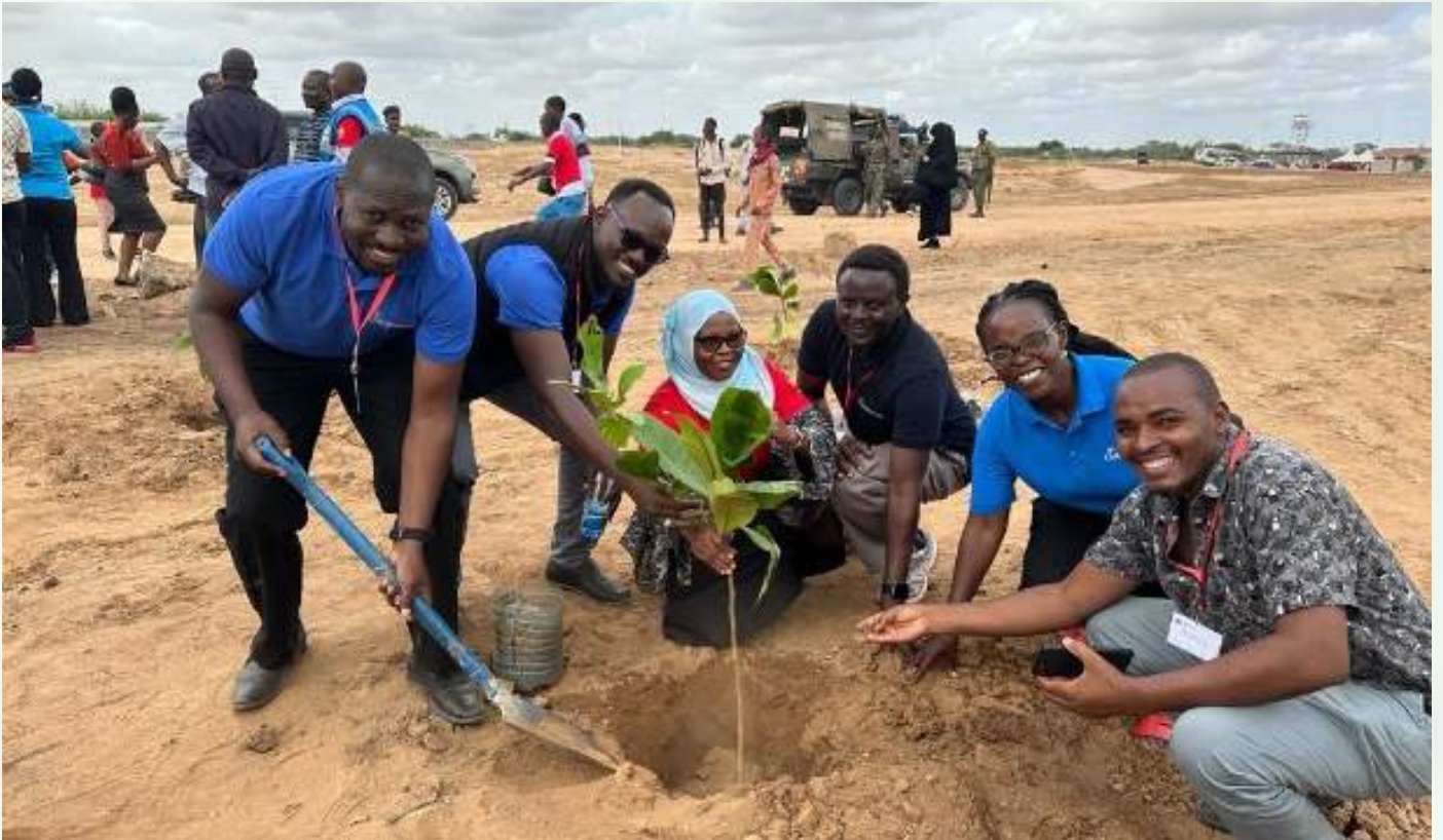
Compassion team with local representatives planting trees at the DAC Celebrations in Garissa County.