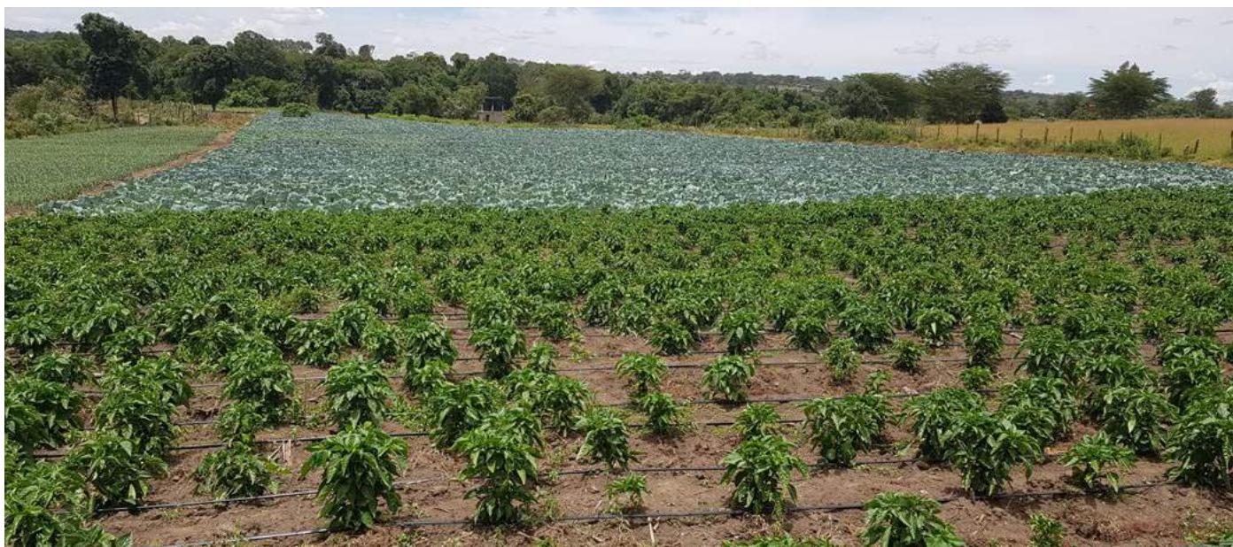
A bird's eye view of the Olepolos horticulture farm.

As a result of this project, caregivers have grown different vegetables like kale, spinach, cabbage, tomatoes, capsicums, onions, amaranths, spider weed, and black nightshade.