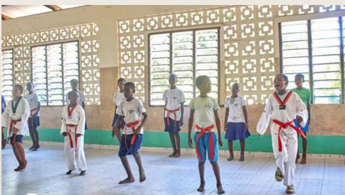
Children performing a play at the exhibition event.