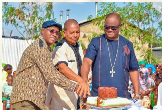
The chief guests cutting a cake to commemorate the launch of the environmental conservation project.

In attendance was our managers of partnerships, the Governor's office, spiritual leaders from the region, regional government administrators, local school headteachers, caregivers, program participants, and over 300 community members.