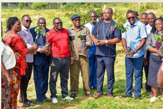
Invited guests ready to plant trees at Maweu PEFA Church.

Prolonged drought has been a challenge for the community in Kwale cluster. The unpredictable weather patterns have affected food security and precipitated the loss of livestock. The 15 churches in the Kwale cluster came together to spearhead the planting of 500,000 drought-resistant trees and fruit trees within the church compounds, homesteads, and public facilities across the sub-county by 2023.