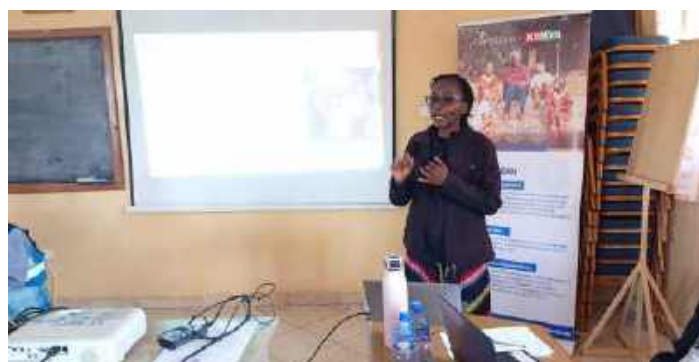
Marsabit Child Protection Training

Child protection remains a core priority for Compassion, and we are committed to ensuring that every child is known, loved, and protected. Through capacity-building efforts, including the training and commissioning of Community Child Protection Volunteers, Compassion is strengthening local systems to safeguard children at the grassroots level. These initiatives in Marsabit County equip communities with the knowledge and skills to prevent, identify, and respond to child protection risks, fostering safer environments where children can grow and thrive with dignity.