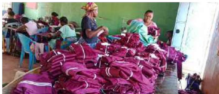
Finished school uniforms are laid out on the table as the group members inspect and organize them in readiness for sale.

Their excellence opened even greater doors, leading to a second tender worth KES 477,000 (USD 3,670) , which they also completed with outstanding results. Today, they are confidently working on their third tender, valued at KES 153,450 (USD 1,180) , a clear sign of their growing capacity and reputation.