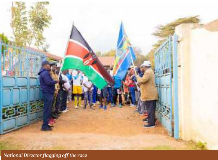
National Director flagging off the race