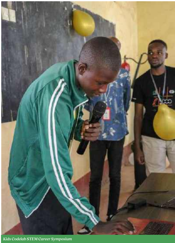
Kids Codelab STEM Career Symposium

These projects offer just a glimpse of the many innovative, problem-solving solutions being created within the program initiatives that could transform communities.