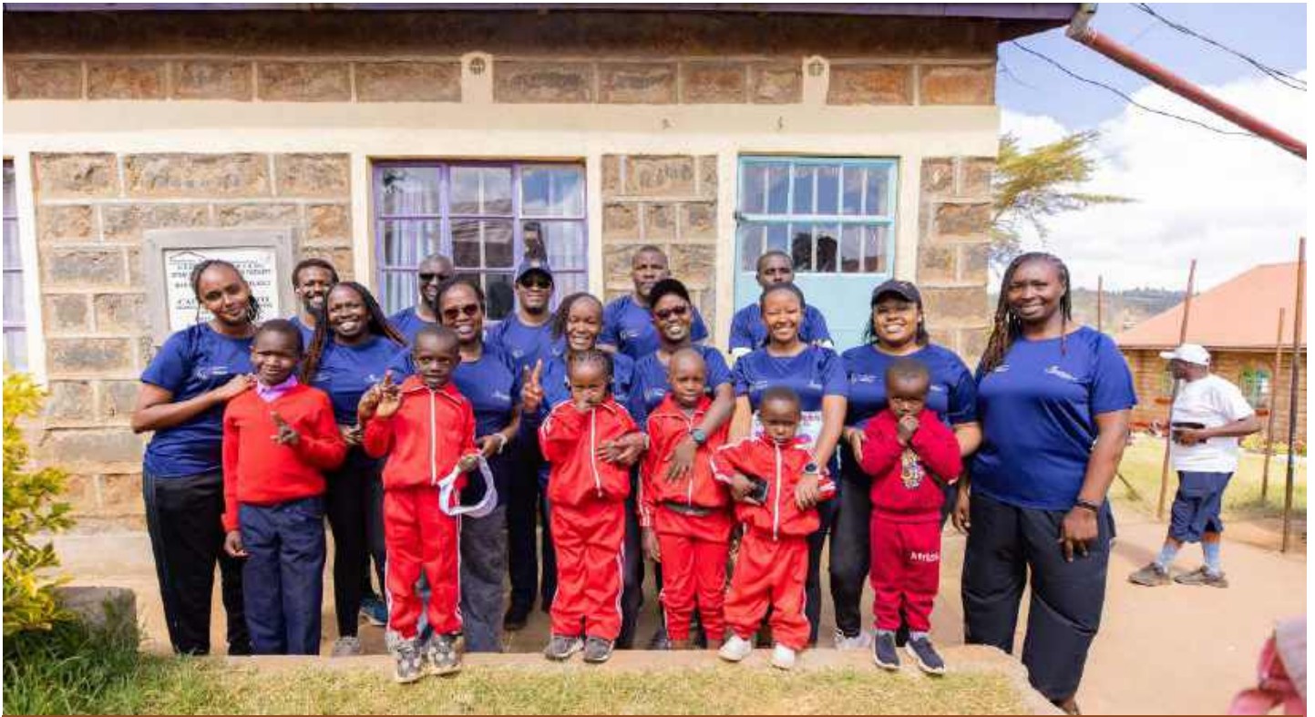
Compassion team with some of the children in the community

A IC Nderu Frontline Church Partner in Ndeiya, Kiambu County, recently hosted a vibrant celebration for the International Day of Persons with Disabilities, bringing together children, caregivers, church leaders, partners, and community members under the global theme "Inclusion in Every Mile." The event featured a county-level marathon, community-wide medical screenings, and a special recognition of the progress made by children enrolled in the church's Special Needs Education (SNE) Class, established in June 2024.