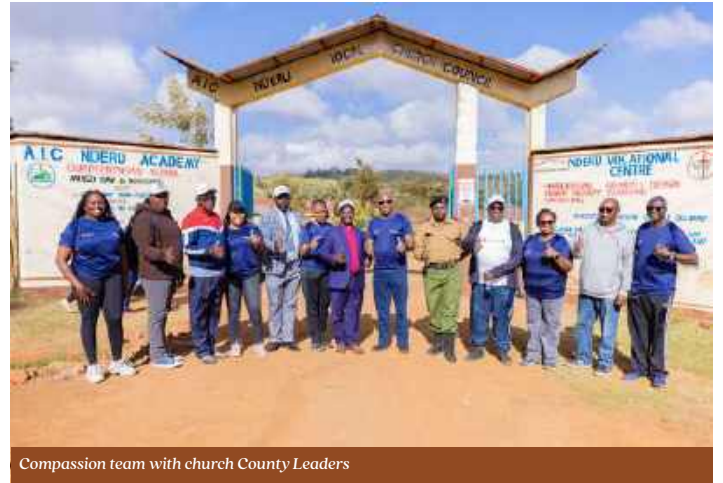
Compassion team with church County Leaders

Across Kenya, Compassion International supports 529 children with disabilities, highlighting the urgent need for early diagnosis, stigma reduction, and the building of inclusive community structures. AIC Nderu's model exemplifies how coordinated church-led support can make a significant impact in Kiambu County and beyond.