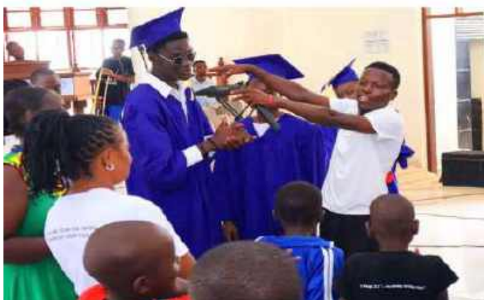
Participants and Family at the graduation