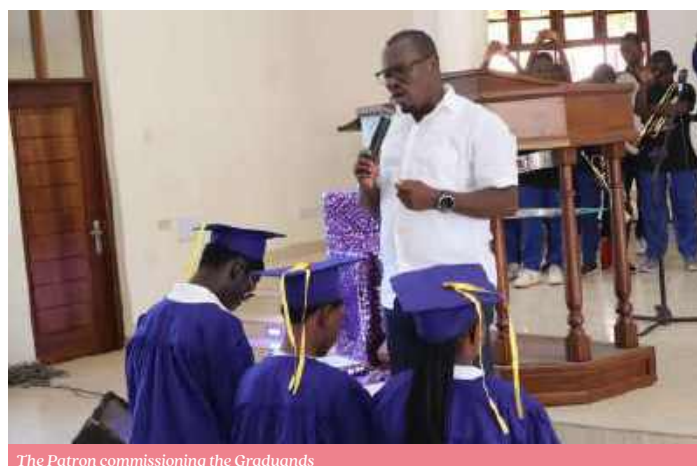
The Patron commissioning the Graduands