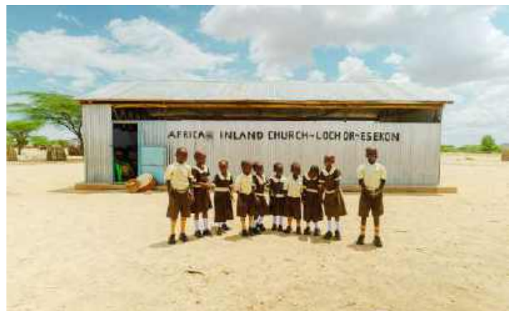
Children in front of newly built classrooms in Turkana

In Turkana, 14 church partners are leading ongoing efforts to transform the region. These churches are strategically positioned to assist highly vulnerable groups. For example, Elim Pentecostal Church in Kakuma serves 255 participants , including families in the survival program, while Parklands Baptist Church Kaatongun supports over 200 children . The African Inland Church in Nakurio is supporting 179 children . Initiatives such as the Pentecostal Assemblies of God in Lokwatubwa and Lokirama also have strong sponsorship.