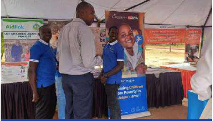
Compassion team and church partners representatives at the exhibition