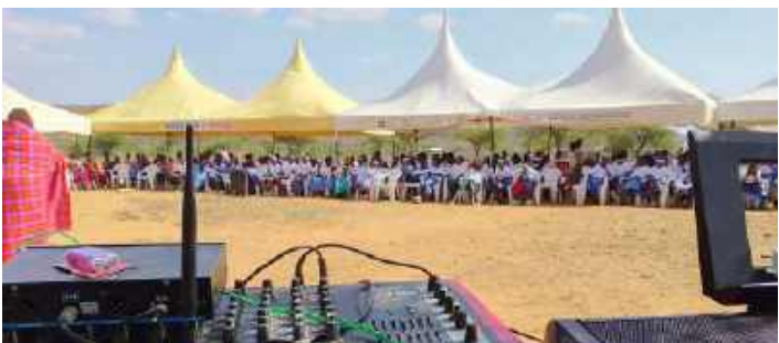
Participants at the Alternative Rites of Passage Ceremony