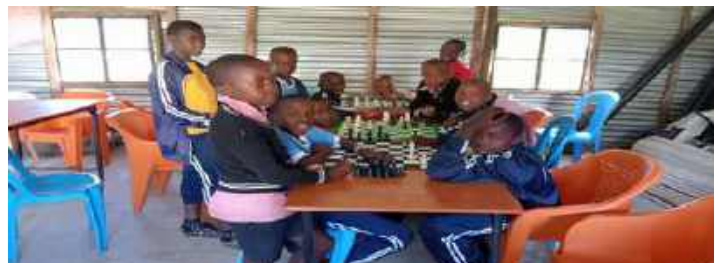
Participant Playing Chess