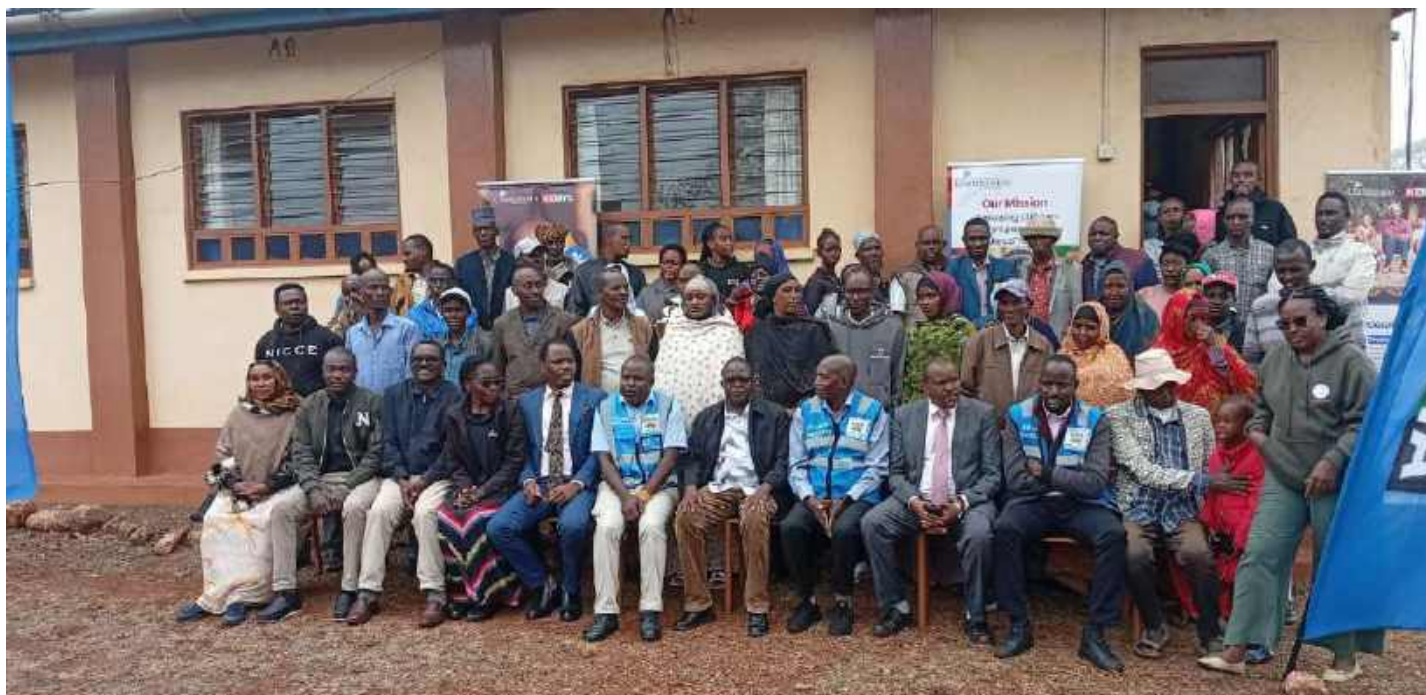
Marsabit Child Protection Training

Child protection remains a core priority for Compassion, and we are committed to ensuring that every child is known, loved, and protected. Through capacity-building efforts, including the training and commissioning of Community Child Protection Volunteers, Compassion is strengthening local systems to safeguard children at the grassroots level. These initiatives in Marsabit County equip communities with the knowledge and skills to prevent, identify, and respond to child protection risks, fostering safer environments where children can grow and thrive with dignity.