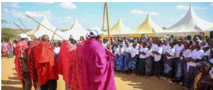
Participants at the Alternative Rites of Passage Event

The training also created an open platform for discussing the risks of FGM. Participants learned about the serious physical and emotional effects of the practice, including heavy bleeding, infections, complications during childbirth, and long-term trauma. Facilitators emphasized that FGM is harmful, illegal, and not required by any religion, encouraging families to choose safer cultural alternatives that celebrate girls without causing harm.