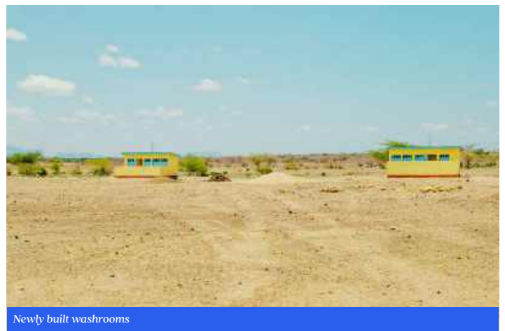
Newly built washrooms

Together, these church partners create a movement of hope and transformation, integrating education, health, and spiritual growth into a comprehensive approach to care. The outcomes of these programs are evident and measurable. In education, children aged three to nine receive early support in literacy and numeracy, while maternal education helps caregivers reinforce learning at home. In health and nutrition, growth monitoring and immunization efforts protect children from preventable diseases, and targeted malnutrition programs are saving lives in areas affected by chronic hunger.