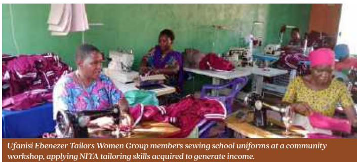
Ufanisi Ebenezer Tailors Women Group members sewing school uniforms at a community workshop, applying NITA tailoring skills acquired to generate income.

Their journey did not stop there. In 2025, the group boldly stepped into new territory, venturing into tracksuit and T-shirt production. With determination and teamwork, they secured and successfully delivered their first tender, valued at KES 279,000 (USD 2,150) .