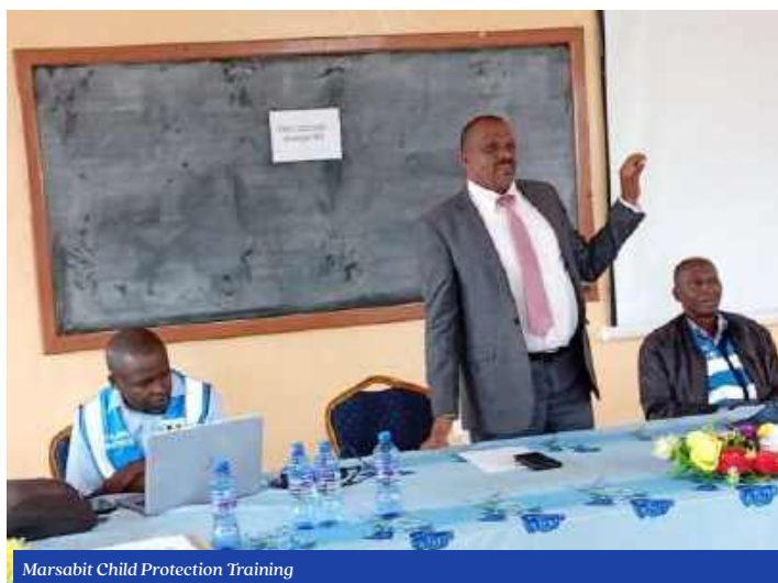
Marsabit Child Protection Training