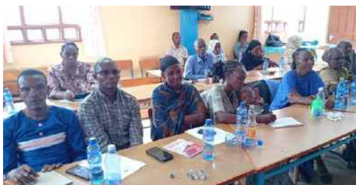
Marsabit Child Protection Training