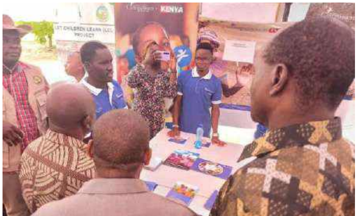
Compassion team and church partners representatives at the exhibition