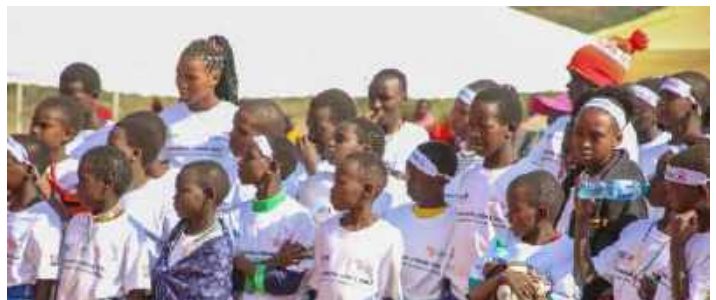
Participants at the Alternative Rites of Passage Ceremony

Parents and caregivers were also involved during the graduation ceremony, where they were made aware of the importance of protecting girls and supporting alternatives to FGM. Community leaders highlighted the need to keep girls in school and strengthen partnerships that support reporting on and prevention of harmful practices.