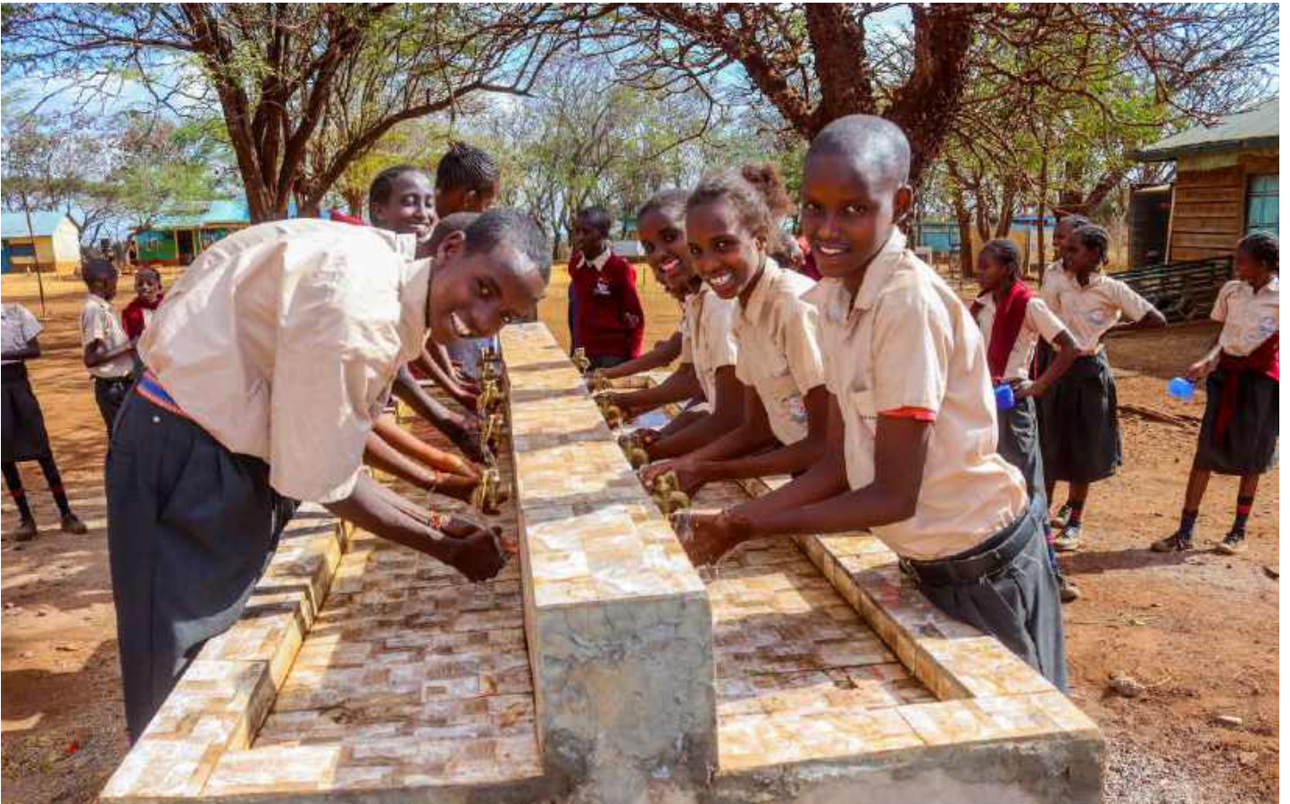
Participants wash their hands at a handwashing point in Karare following the installation of the community water project, which aims to improve access to clean water.

W ater scarcity has long been a defining feature of Karare ward in Marsabit County. Families walked long distances, often more than five kilometers, to reach unreliable and unsafe water sources. Preventable diseases such as typhoid and diarrhea were a constant threat, and children often missed school to help their caregivers fetch water. In Karare, water is not just a need; it is a daily struggle. Today, a journey that began in January 2024 has culminated in the establishment of a solar-powered borehole system under the professional supervision of Beta Geo Consultants Limited, changing the story in the Karare community. With 72 solar panels now fully installed and operational, the system provides a reliable, sustainable source of clean water. It is safe to say that the success of this project goes beyond infrastructure. It lies in the people who now own and sustain it.