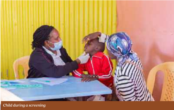
Child during a screening

A major highlight of the celebration was the free disability and medical screening conducted by Bethany Kids International. Children and adults were assessed for mobility challenges, neurological concerns, and developmental delays, with on-site care provided to those who needed immediate support. Individuals needing advanced intervention were referred to specialized facilities, and Bethany Kids will continue mentoring AIC Nderu as the sensory room is developed and teachers receive ongoing training.