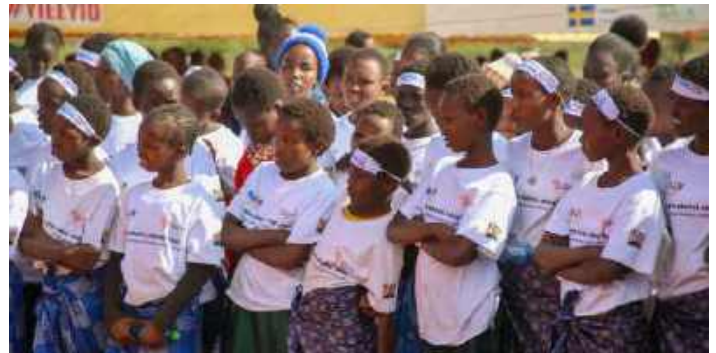
Participants at the Alternative Rites of Passage Ceremony