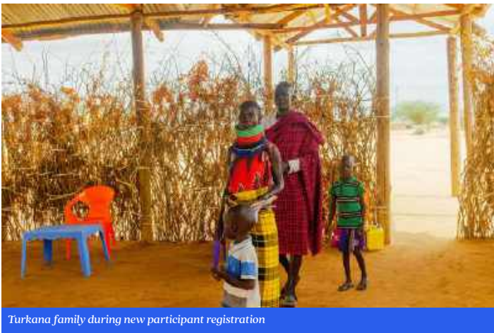
Turkana family during new participant registration