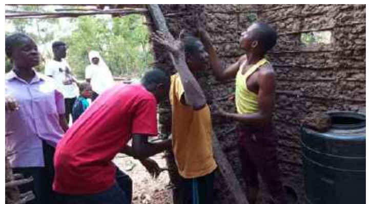
Dzame and her fellow youths during the activity