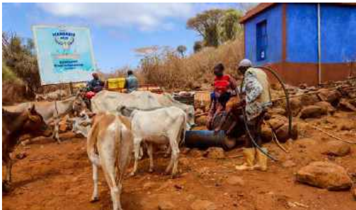
Animals gather to drink water at the Karare water point, where the project has improved access in the dry region for both residents and livestock.

This has resulted in over 400 households having reliable access to safe water. Through local contributions such as fencing the borehole site and renovating the community storage tanks, residents have demonstrated a strong sense of ownership. This shared responsibility has fostered unity and reinforced the initiative's sustainability.