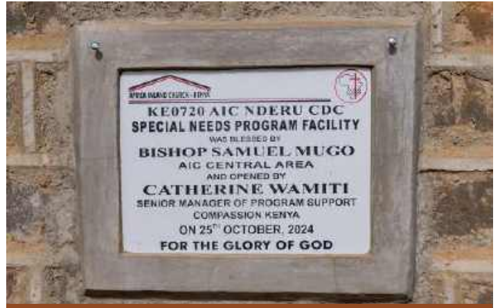
Special needs center for children with disabilities