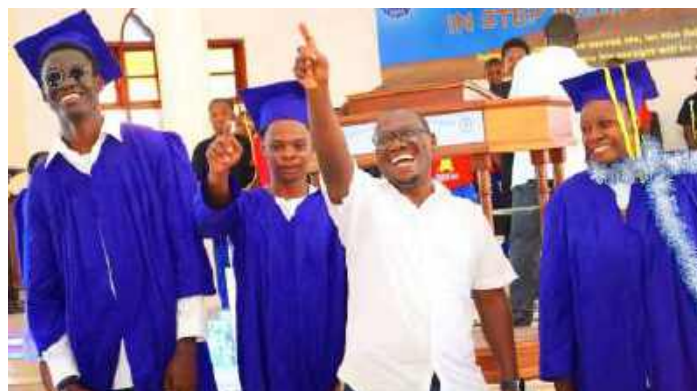
Celebration with our Patron

For many of these young people, the journey began years ago, when they joined the project at age 12 after being transferred from another center following a project closure. Over time, the program supported them through different stages of life, nurturing their spiritual, emotional, educational, and social development. Now, at age 21 and older, they are ready to begin the next chapter of their lives. The celebration honored not only the achievements of the graduates but also the dedication of families, the church, the community, and program staff who supported them throughout their journey.