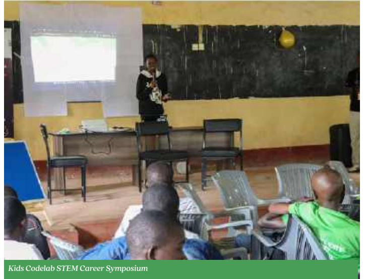
Kids Codelab STEM Career Symposium

The event wrapped up with an awards ceremony celebrating creativity and excellence. Participants received cash prizes, robotics and programming kits, and coding guidebooks—further fueling their passion for technology. Beyond the awards, the symposium's true impact was reflected in a renewed sense of purpose among learners, increased resilience among current participants, and growing interest in STEM among new learners.