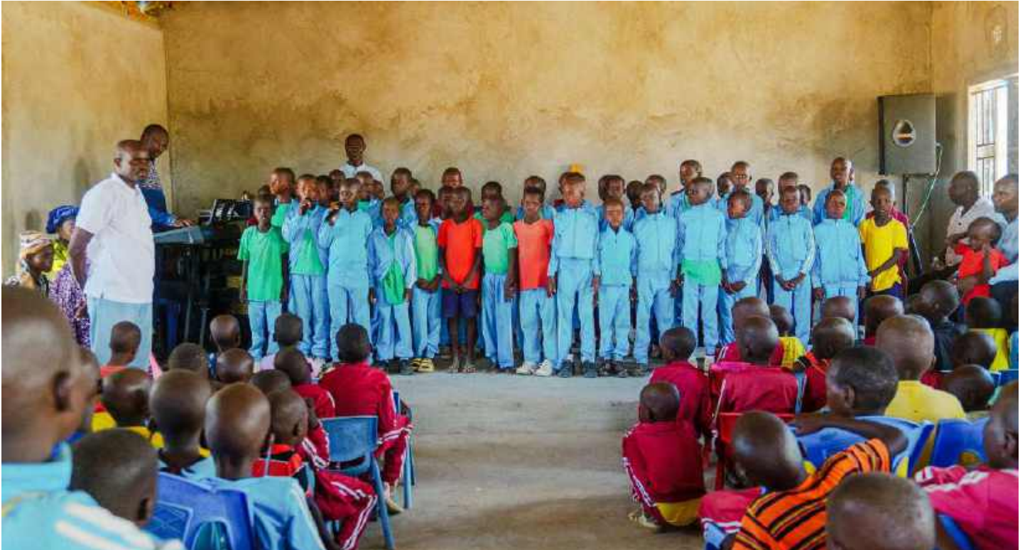
Children during devotion

Turkana, in Kenya's remote northwest, faces a dry climate, food shortages, and limited access to services. Despite these hurdles, communities there are experiencing a comprehensive transformation through partnerships with 14 frontline churches supported by Compassion International. These collaborations provide children, caregivers, and church leaders with resources to build resilience and foster growth in one of Kenya's most underserved regions.