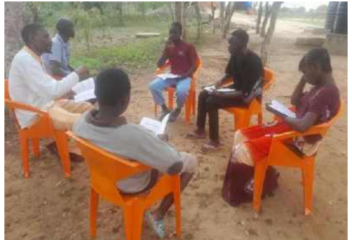
Bible study sessions with fellow participants