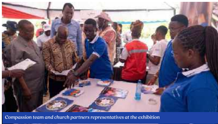
Compassion team and church partners representatives at the exhibition