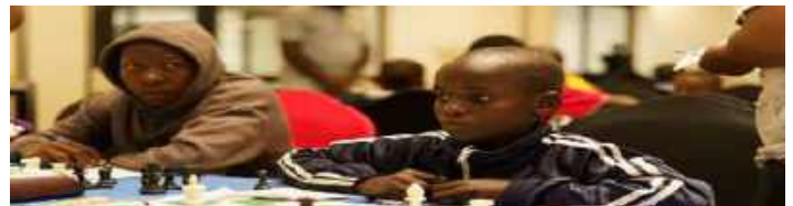
Participant Playing Chess