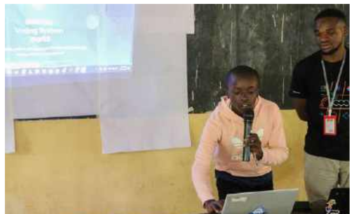
Participant making a presentation

The plenary session featured a town hall-style discussion where professionals shared their personal journeys—highlighting the challenges of developing digital skills, the wide range of career and income opportunities in tech, and emerging fields with untapped potential.