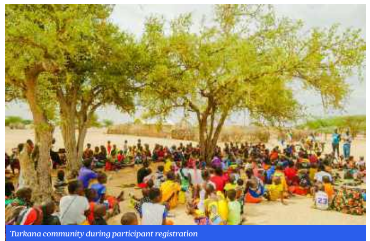
Turkana community during participant registration

Churches and project staff are receiving leadership and advocacy training to strengthen local capacity to sustain and expand these efforts. Spiritual growth is integrated into all activities to help children and families deepen their understanding of Christ and live out His love daily. Looking ahead, the situation in Turkana remains optimistic and ambitious. Priorities include improving early education and literacy, expanding maternal and caregiver training, and increasing efforts to treat and prevent malnutrition.