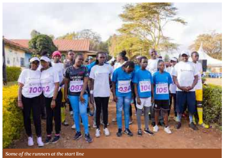
Some of the runners at the start line

These achievements show the positive effects of regular therapy, caregiver support, and an inclusive learning environment. Caregivers are also gaining strength through home visits, discipleship, hygiene support, and entrepreneurship training with start-up funds.