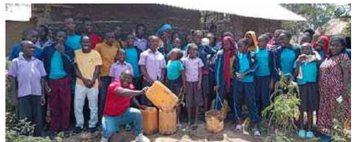
Group Photo of the youths and 2 part time teachers after community Service