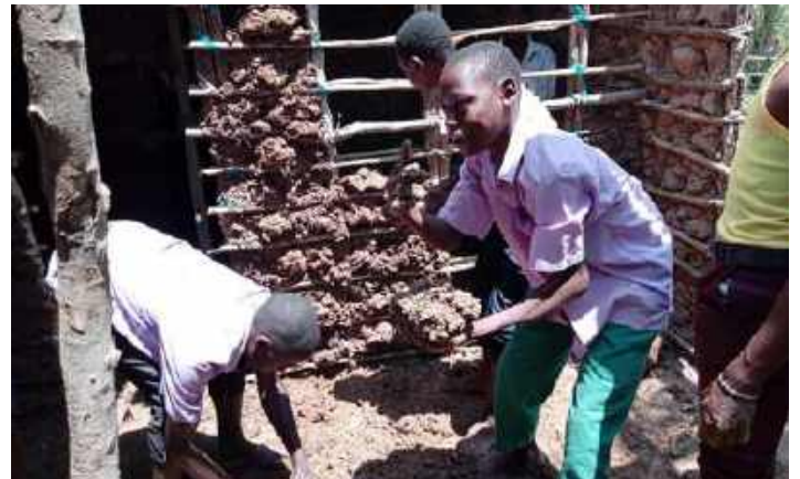
Youths filling the mud