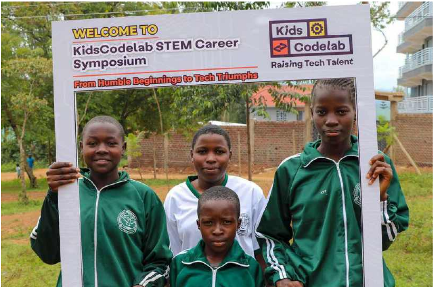
Kids Codelab STEM Career Symposium

S TEM career pathways are opening up exciting opportunities for learners within the Competency-Based Curriculum, equipping them with practical skills for the future. In Homabay County, this vision was realized during the half-term school break through a lively STEM Symposium at Rawinji Resource Center in Oyugis, Homa Bay County. The event was organized in partnership with KidsCode Lab, Compassion's main coding training partner.