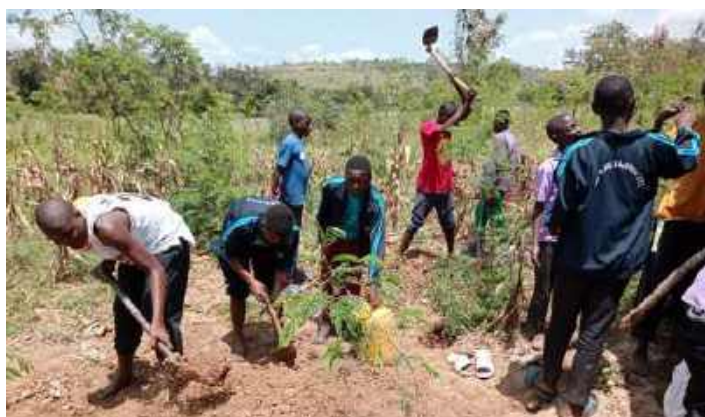
Part of the youths participants Preparing the Mud for house renovation

The initiative has also inspired neighbors and community members, showing that even with limited resources, communities can make a meaningful difference when they unite for a common purpose. Thanks to the dedication of the youth from AIC Majengo CDC, the project became more than just building a house; it became a powerful reminder that compassion, unity, and determination can transform lives.