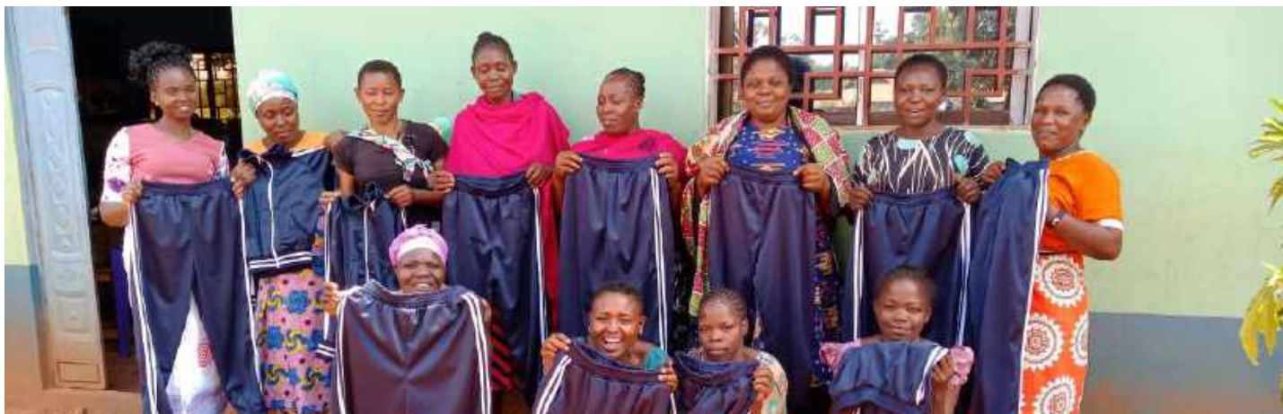
Members of the Ufanisi Ebenezer Tailors Women Group pose for a photograph with completed school uniforms, which they produce and sell as a source of income.

As a powerful story of resilience and transformation continues to unfold in Ganze, it reflects the true spirit of empowering women and creating lasting change in a community. In 2020, a group of determined women from vulnerable communities in Ganze, Kilifi County came together with a shared dream: to transform their lives through tailoring. They formed the Ufanisi Ebenezer Tailors Women Group, a name that would soon become synonymous with courage, growth, and possibility. Most of these women had never set foot in a classroom, yet their lack of formal education did not define them. Instead, they carried resilience, passion, and an unshakable desire for a better future.