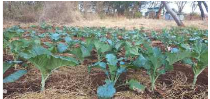
Green- leafy vegetables grow in a kitchen garden in Karare, where improved access to water through the borehole project has supported local food production.